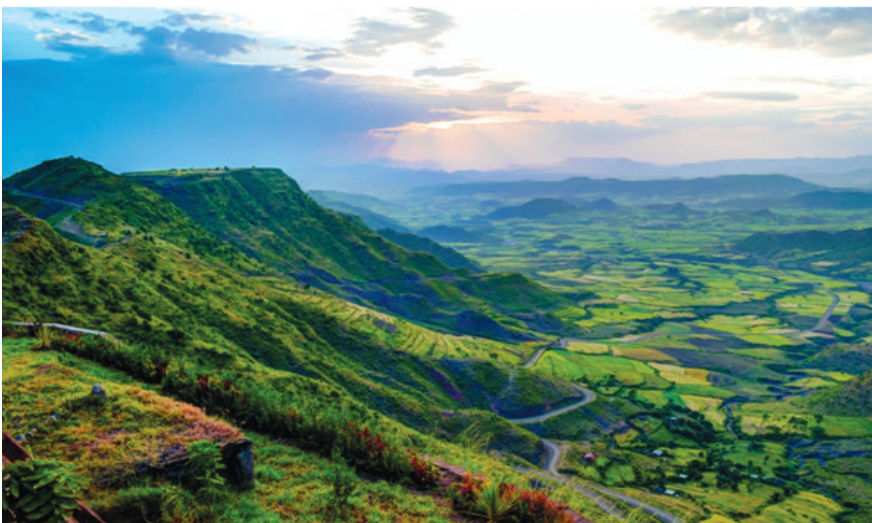
Photo: The landscape and context of Ethiopia.

The focus group discussion identified 30 possible contributors to the status of the epidemic in Ethiopia. These possible contributors were then categorized into four potential explanatory interpretations (see Table 1 ). Each explanatory interpretation was tested against current evidence identified in the literature, as summarized below.